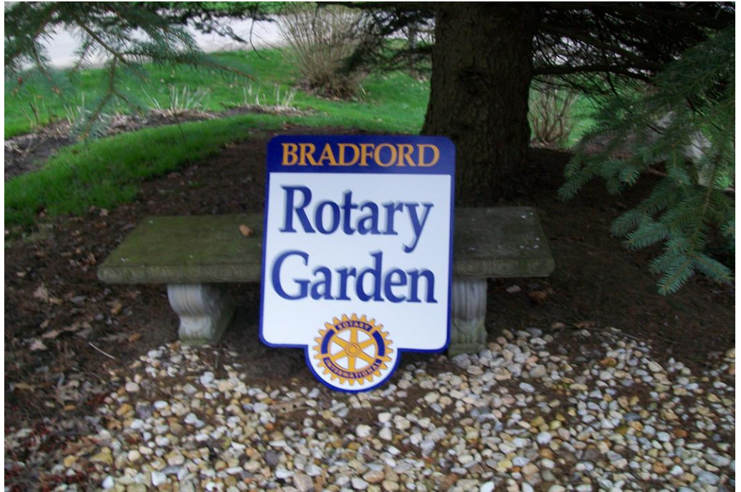
A District Simplified Grant helped fund this sign for Rotary's city rose garden.

The Bradford Rotary Club is on the Web at www.bradfordrotary.org Also go to Facebook and simply type in: Bradford Rotary Club. You'll be surprised at what you will discover.